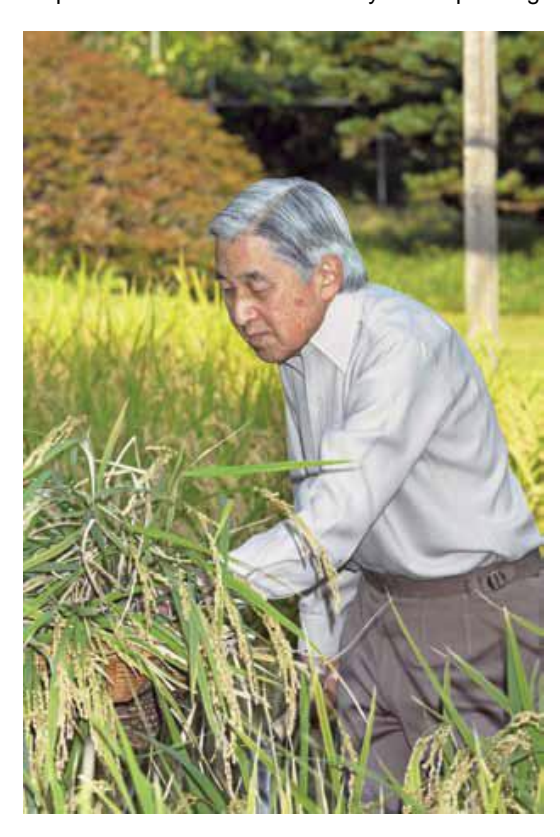
Emperor Akihito harvests rice. (September 2011)