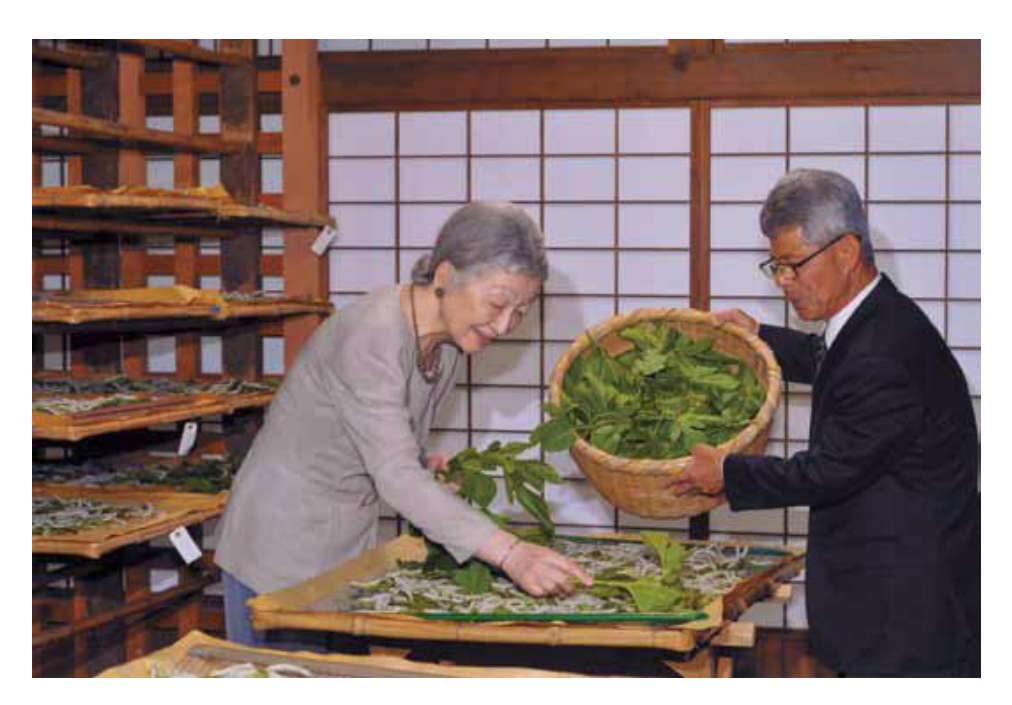
Empress Michiko feeds mulberry leaves to silkworms at the sericulture centre in the Imperial Palace Grounds. (May 2013)

The Empress raises silkworms at the Palace sericulture centre, with the help of several staff members. She feeds the silkworms with mulberry leaves, following the precedent set in 1871 by Empress Dowager Sho-ken, Empress and consort of Emperor Meiji, the great-grandfather of His Majesty. Every spring, the Empress tends 120,000 to 130,000 silkworms during almost more than two months and harvests some 150kg of cocoons in the beginning of summer. Some of the silk produced is used for the restoration of old textile material of historical value kept by the Imperial Family at the Shosoin Repository in Nara since the 8th century, when it was the capital of the country.